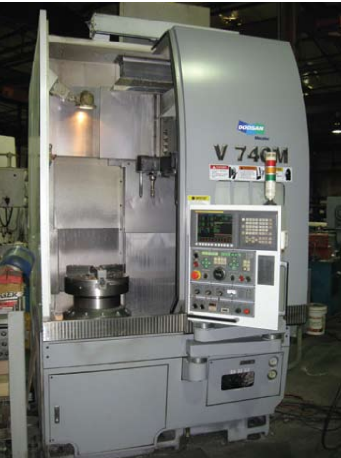
Internal Machining Capabilities