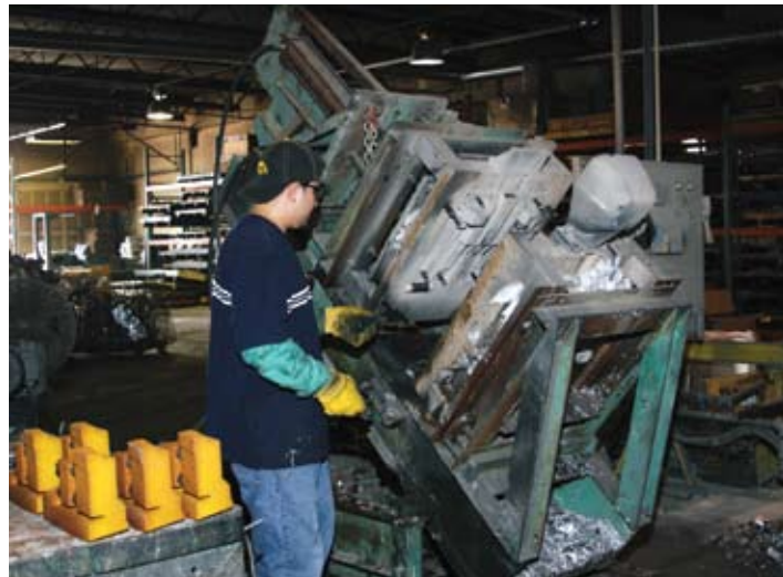
Permanent Molding Process