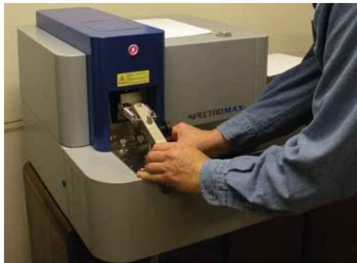
Quality Spectrometer Testing