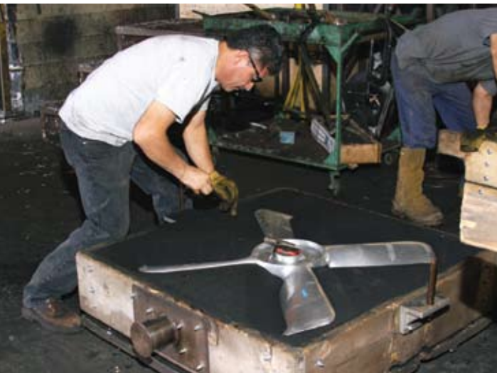
Loose Piece Molding