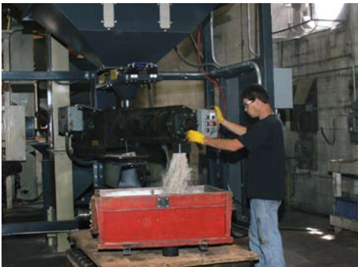
Air Set Molding Process