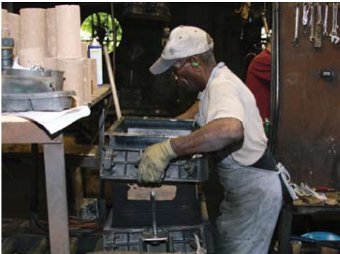
Squeezer Molding Process

Twin City Holland Industries is strategically located in Davenport, IA in the heart of the Midwest and just three hours west of Chicago. Our 30,000 square foot facility is minutes from Interstate 80 and Interstate 74 making shipping by truck convenient and cost efficient. Our products are shipped to customers throughout the United States as well as Canada, Mexico and South America.